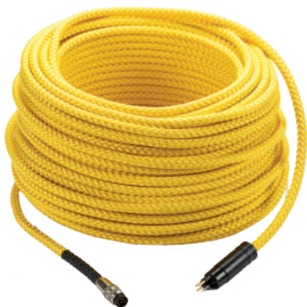
Professional surface/diver cable (50meters -165 ft long) (Sold separately code OR033134)

6 pin cable/wire with yellow rope exterior. The cable's diameter is 10mm with a resistance of more than 4000 Newton.