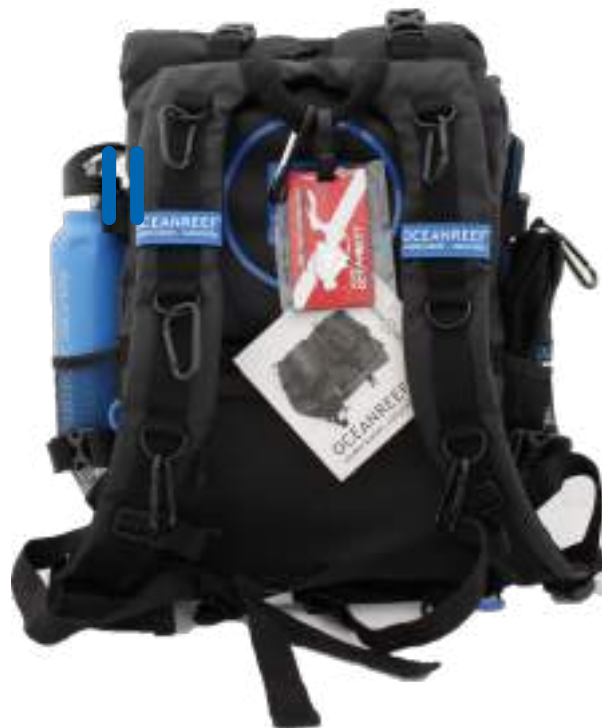
OCEAN REEF NAME TAG