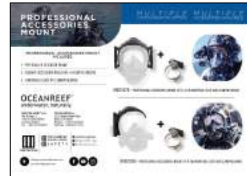
Professional Accessories Mount ENG CLICK! ORMP0135