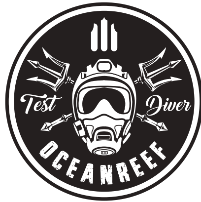
PATCH TEST DIVER