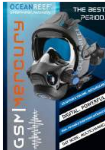
FLYER GSM MERCURY ENG CLICK! ORMP0098 DE CLICK! ORMP0104 SP CLICK! ORMP0106 IT CLICK! ORMP0145