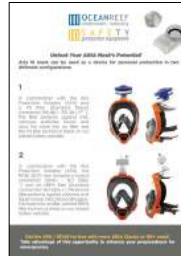
ARIA AND APA (US ONLY) ENG CLICK!