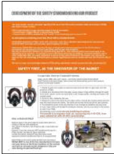
FLYER Snorkeling Safety ENG CLICK! ORMP0095 DE CLICK! FLYER ORMP0091