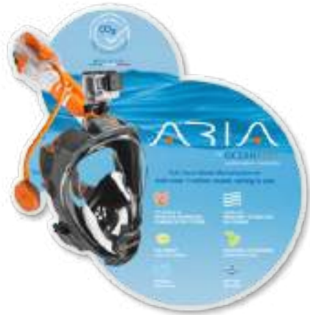
ARIA SHOP WINDOW ORMP0060