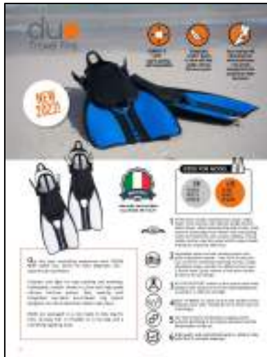
DUO II - (Dealer_presentation) ENG CLICK! ORMP0164