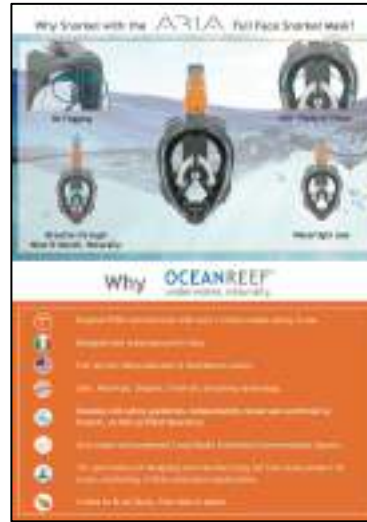
FLYER Why snorkel with Aria ENG CLICK! ORMP0093 IT CLICK! ORMP0158