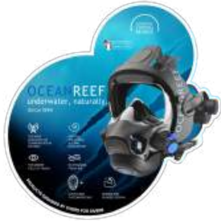
IDM SHOP WINDOW ORMP0068