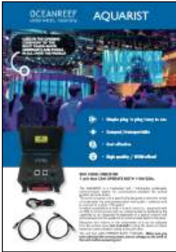
FLYER AQUARIST ENG CLICK!