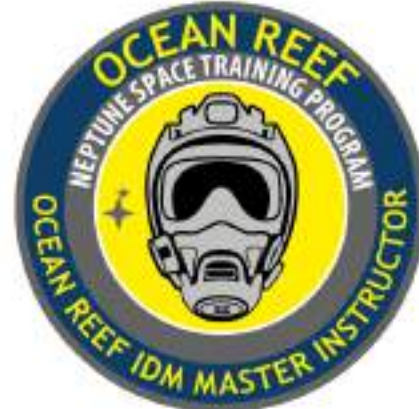
PATCH IDM INSTRUCTOR