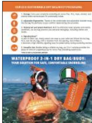
FLYER_DRY BAG_BUOY ENG CLICK! ORMP0165