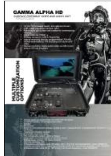
FLYER GAMMA ALPHA HD ENG CLICK! ORMP0142