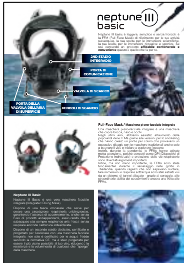
FLYER NEPTUNE III BASIC ENG CLICK! ORMP0143 DE CLICK! ORMP0159 ITA CLICK! ORMP0156