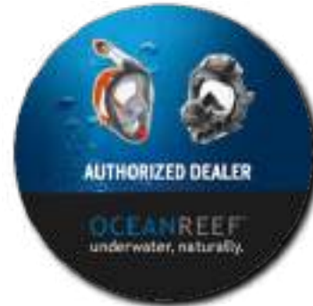
AUTHORIZED DEALER STICKERS 30004