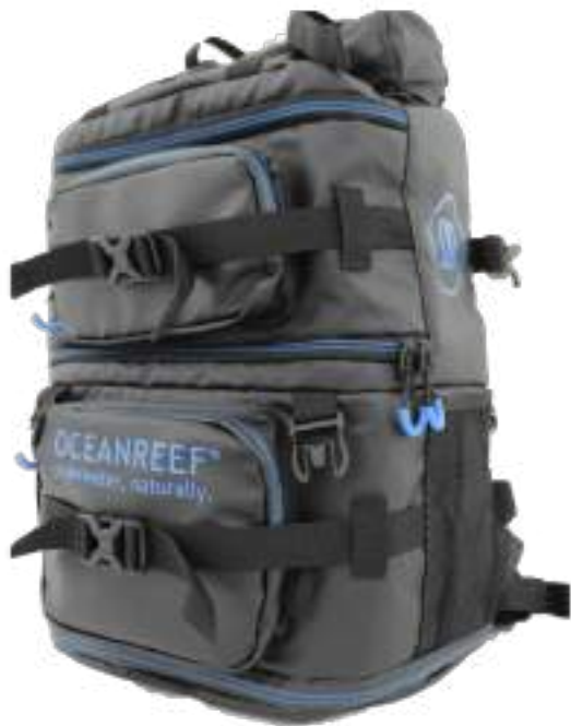
BACKPACK NEPTUNE III