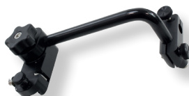
OCEAN REEF Shearwater Nerd2 HUD mount for FFMs.