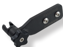
OCEAN REEF Scubapro Galileo HUD Extender Mount