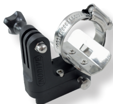
Combo Mount on Universal Slide