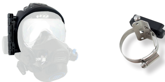
Professional Accessories Mount Kit R (w/universal slide and clamping band)