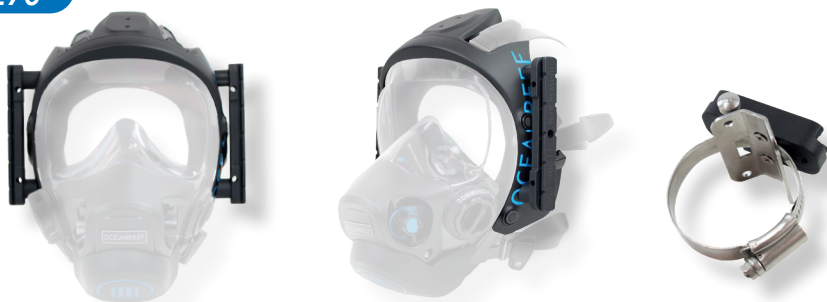
Professional Accessories Mount Kit R+L (w/universal slide and clamping band)