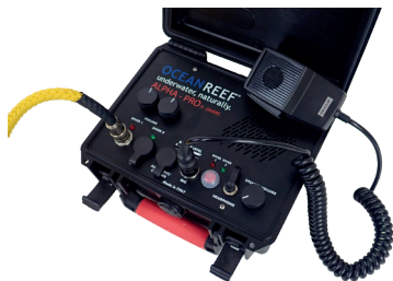
1 - SURFACE UNIT W/MIC & CHARGER