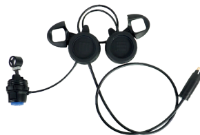
3 - UW UNIT