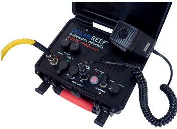
1 - SURFACE UNIT W/MIC & CHARGER