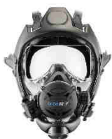
SPACE EXTENDER SPACE EXTENDER 100