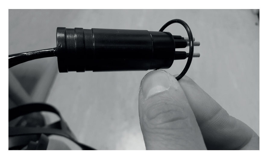
Hold cable in place with 3d Oring - as shown.