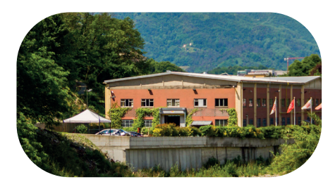
OCEAN REEF USA