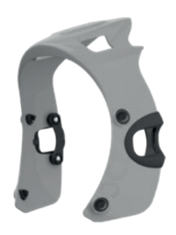
Extender Frame Assembled