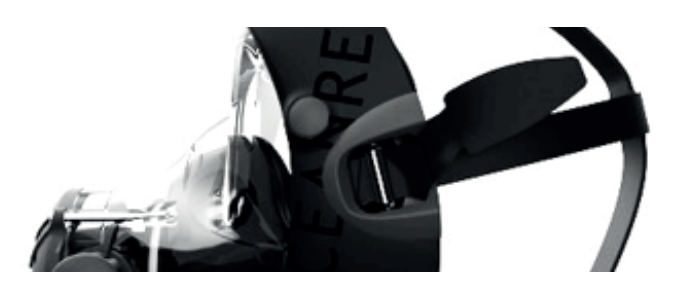
DM with assembled frame (straps detail).