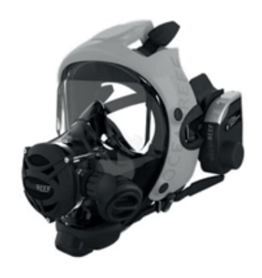
IDM + new NACS + Communication unit.