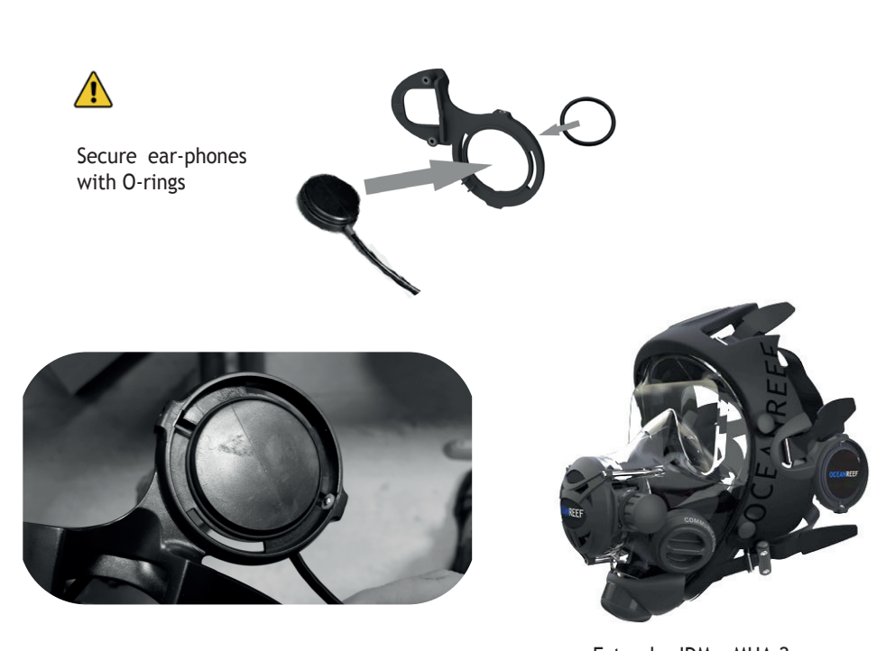
Extender IDM + MHA-2.