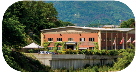
MESTEL SAFETY ITALY

In order to limit our paper consumption, and as a part of our environmental friendly and responsible approach, OCEAN REEF prefers to put user documentation online rather than print them out.