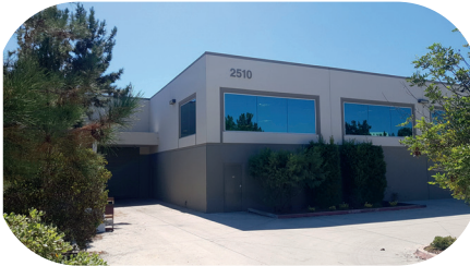
OCEAN REEF USA

More than 70 years, OCEAN REEF has been involved in the underwater diving industry. We have contributed much to this industry, from fins and snorkels to the most modern systems of underwater communication. Through the spirit of intrepid pioneers, brilliant inventors, passionate divers, and dynamic entrepreneurs, OCEAN REEF has been able to turn dreams into reality in the underwater world.