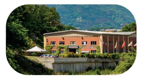
OCEAN REEF USA