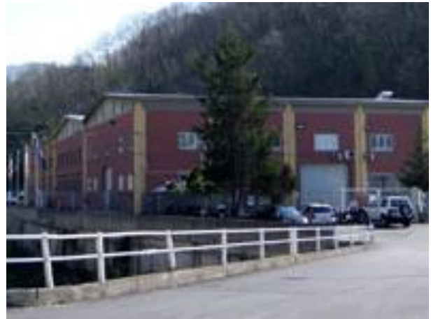
MESTEL Safety ITALY

In order to limit our paper consumption, and as a part of our environmental friendly and responsible approach, OCEAN REEF prefers to put user documentation online rather than print them out.