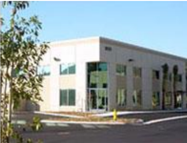
OCEAN REEF USA

For nearly 60 years, OCEAN REEF has been involved in the underwater diving industry. We have contributed much to this industry, from fins and snorkels to the most modern systems of underwater communication. Through the spirit of intrepid pioneers, brilliant inventors, passionate divers, and dynamic entrepreneurs, OCEAN REEF has been able to turn dreams into reality in the underwater world.